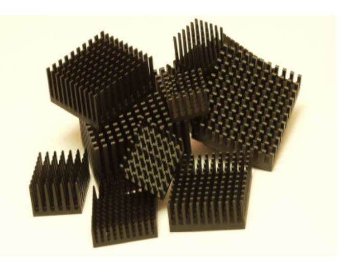
Figure 1. ATS Pin Fin Heat Sinks.

There are many parameters that affect a heat sink's overall performance. The parameters engineers should pay special attention to are the convection mode (natural convection/ force convection), flow conditions (approach air velocity/flow directions), heat sink thermal resistance, heat sink pressure drop and choice of sink material and cost.