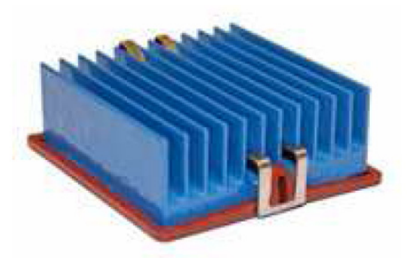
Figure 2. ATS Straight Fin Heat Sink with superGRIP Attachment.

A straight fin heat sink is by far the most common type available on the market. Its fins extend from the base and run the entire length of the sink. The fin thickness may vary from base to tip. Straight fins are mostly made by extrusion, which is the most cost effective way to manufacture a heat sink. Straight fins can also be made by bonding or soldering the fins to the base, or by forging or casting. Straight fin sinks can be cut at regular intervals, too, but at a coarser pitch than a pin fin type. Figure 2 shows an extruded straight fin heat sink.