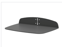
UTILITY SHELF DARK GREY 97-507-282

Additional accessories available in white