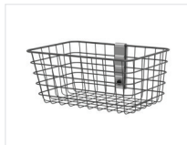
SMALL WIRE BASKET DARK GREY 98-136-282