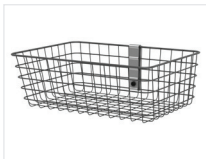
LARGE WIRE BASKET DARK GREY 98-135-282