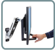
Monitor & Handle Kit (black) 97-760-009 Dual Monitor & Handle Kit (black) 97-718-009