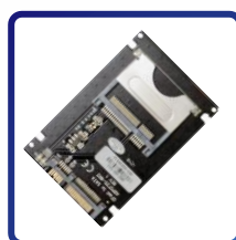
CFast to SATA Adapter-P1053