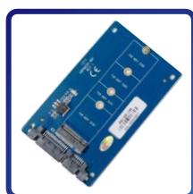
M.2(NGFF) to SATA Adapter-P1051