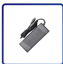
12V Power Adapter x 1