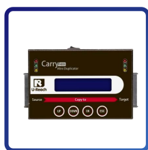
PRO118M Duplicator x 1