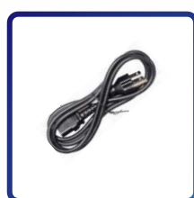
Power Cord x 1