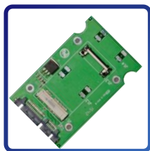
mSATA to SATA Adapter-P1041