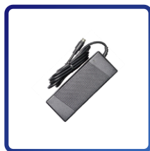
12V Power Adapter x 1