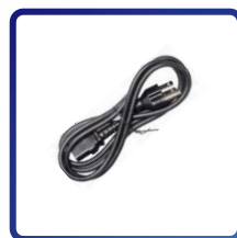
Power Cord x 1