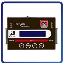
PRO198M Duplicator x 1