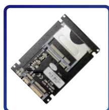
CFast to SATA Adapter-P1053