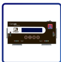
PRO398M Duplicator x 1