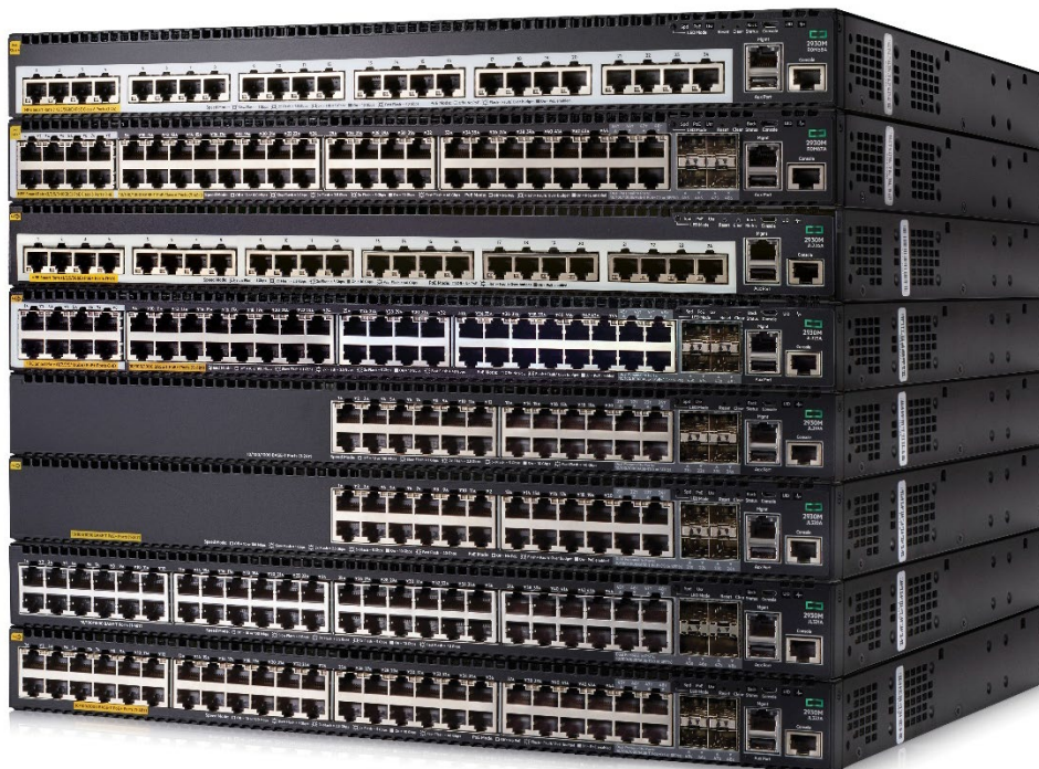
HPE Aruba Networking 2930M Switch Series

The HPE Aruba Networking 2930M Switch Series provides a simple and powerful access layer solution that can be quickly set up at branch offices with little or no IT support using Zero Touch Deployment. The switches include a Limited Lifetime Warranty.