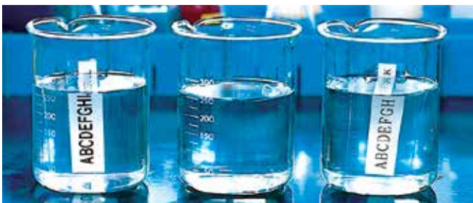
Water and chemical resistant

After laminated labels were placed in a fade-inducing chamber to simulate a year in sunny surroundings, the text was unaffected.